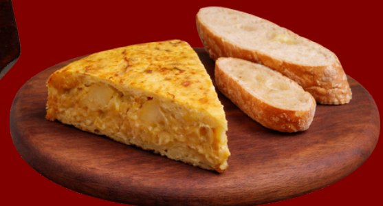
★ Spanish Omelette