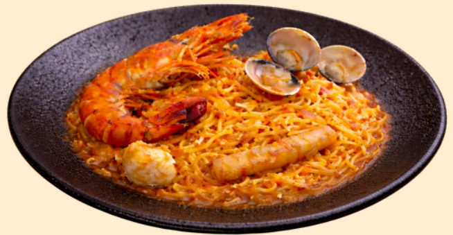
Noodle Seafood Paella