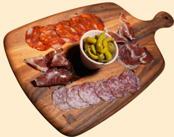
Iberico Cold Cuts Platter