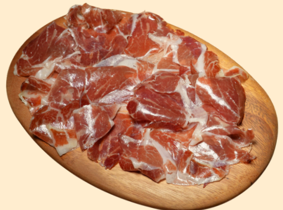
Jamon Iberico Joselito Platter