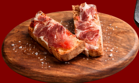
★ Jamon Iberico Joselito Toasts