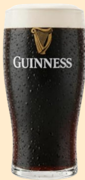
Guinness Stout Beer