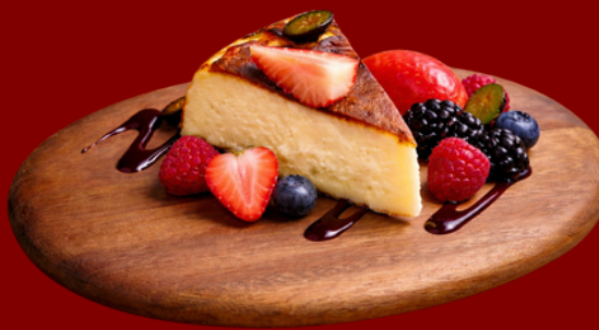
San Sebastian Burnt Cheesecake