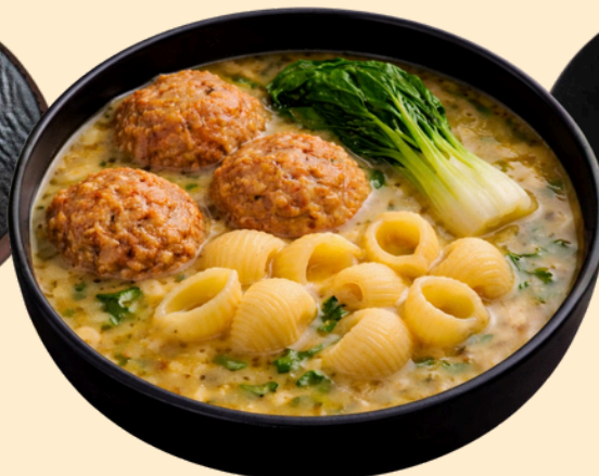
Pasta Soup with Pork Meatballs