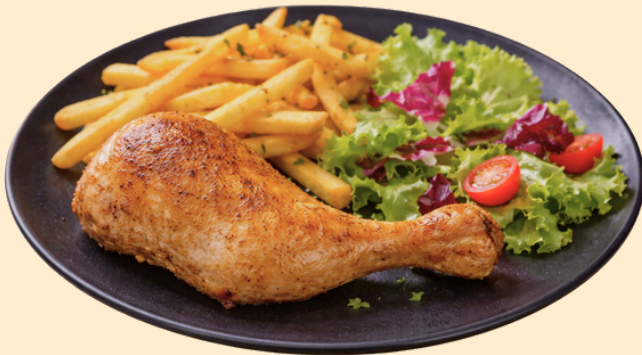
Baked Chicken with Fries