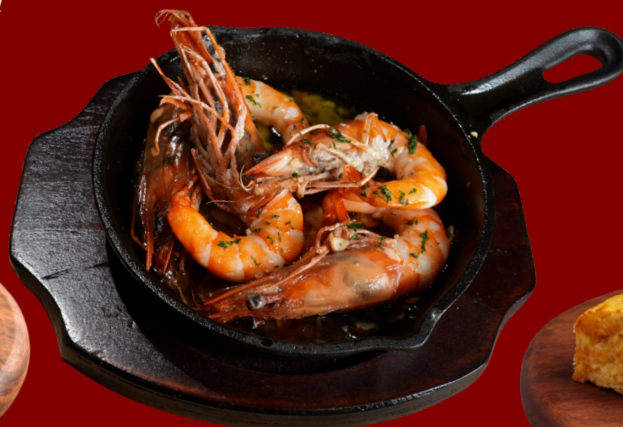
★ Garlic Prawns