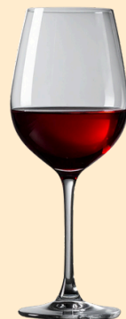
Selection of white and red wine