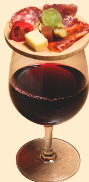
Mini Charcuterie Topper