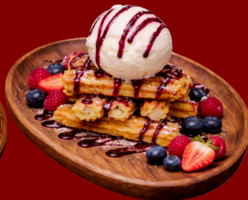
Fusion Frutal Churroholics